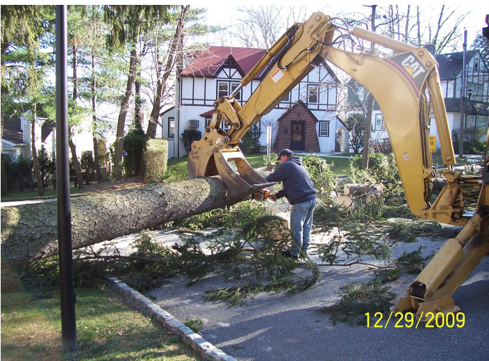
A large pine tree fell across Terrace Drive on the morning of December 29th due to heavy winds. The DPW was on the scene within minutes of the call.