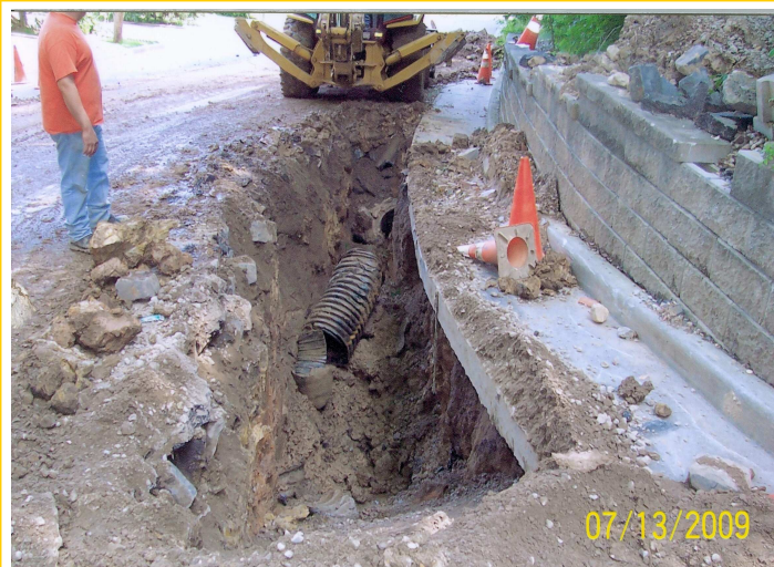
Picture 4—the trench which was dug to allow for installation of the new storm water pipe..