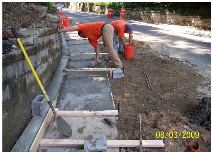
Picture 7—Dan Shaffer and Supt. Mazurkiewicz putting the finishing touches on the concrete.