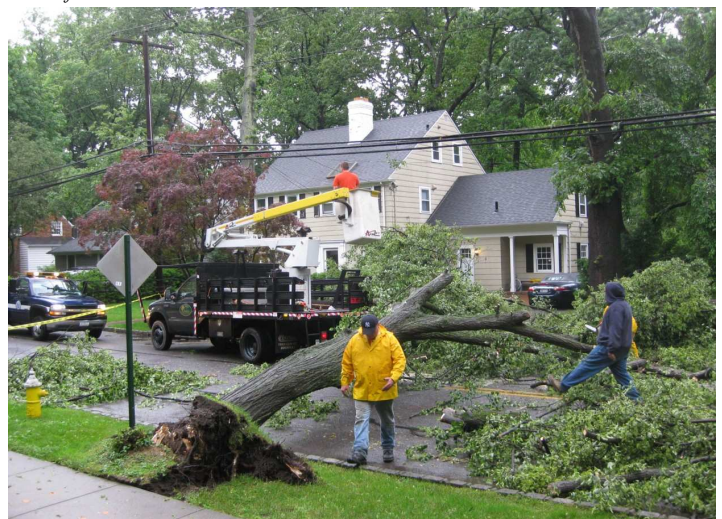
In June, a tree fell across Shoreward Drive and was quickly removed by the DPW crew.