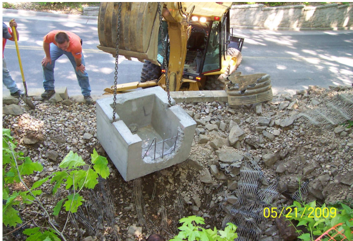
Picture 1— The DPW crew lowers the new catch basin behind the retaining wall on Colonial Road.

This particular job was the largest project the Public Works Department ever undertook.