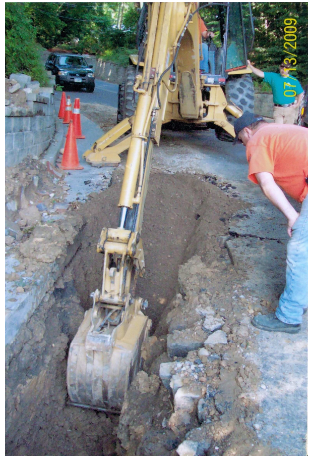
Picture 3— Supt. Mazurkiewicz overseeing the excavation of the trench.