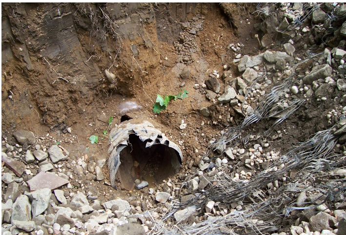
Picture 2— an unmapped storm water pipe under Colonial Road which had collapsed.