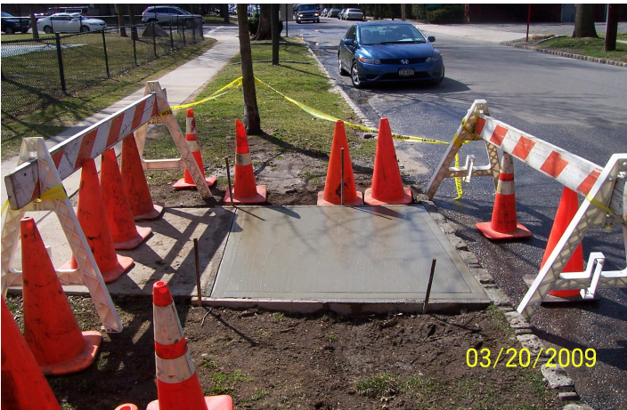
Newly paved sidewalk on Shoreward Drive completed by the DPW