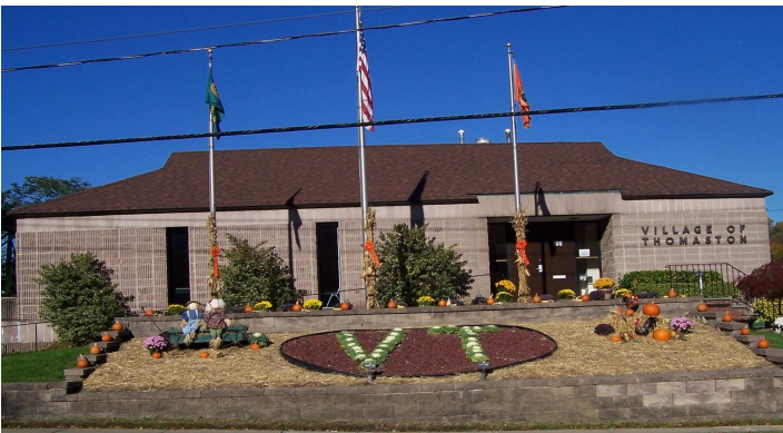
The Village Hall's Autumn display

The Village is seeking volunteers to serve on the Tree Committee , an advisory body to the Board of Trustees with respect to the Village's policy concerning the preservation of trees. If you are interested in serving on this committee or any of the Village's various boards such as the Design Review Board or Zoning Board of Appeals, please call the Village Hall at 482-3110.